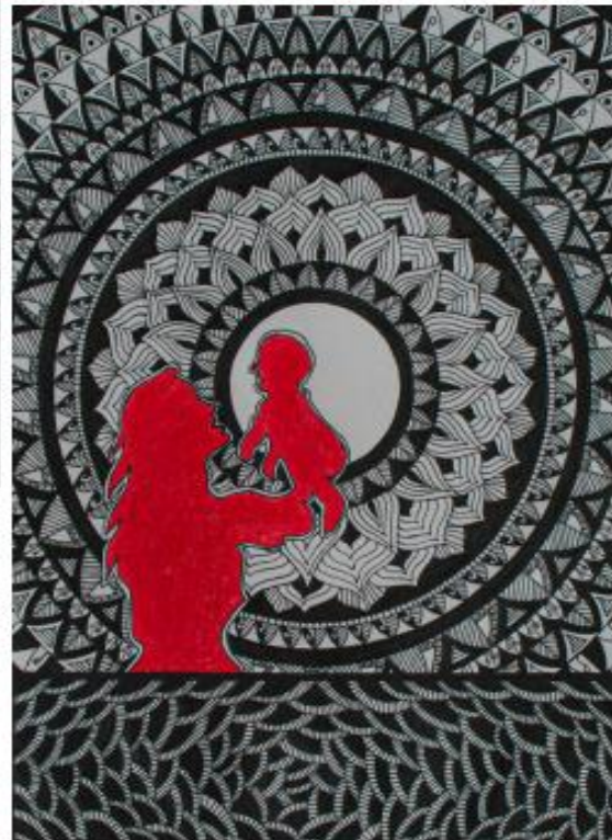
Shubham Mudi Section - " A "