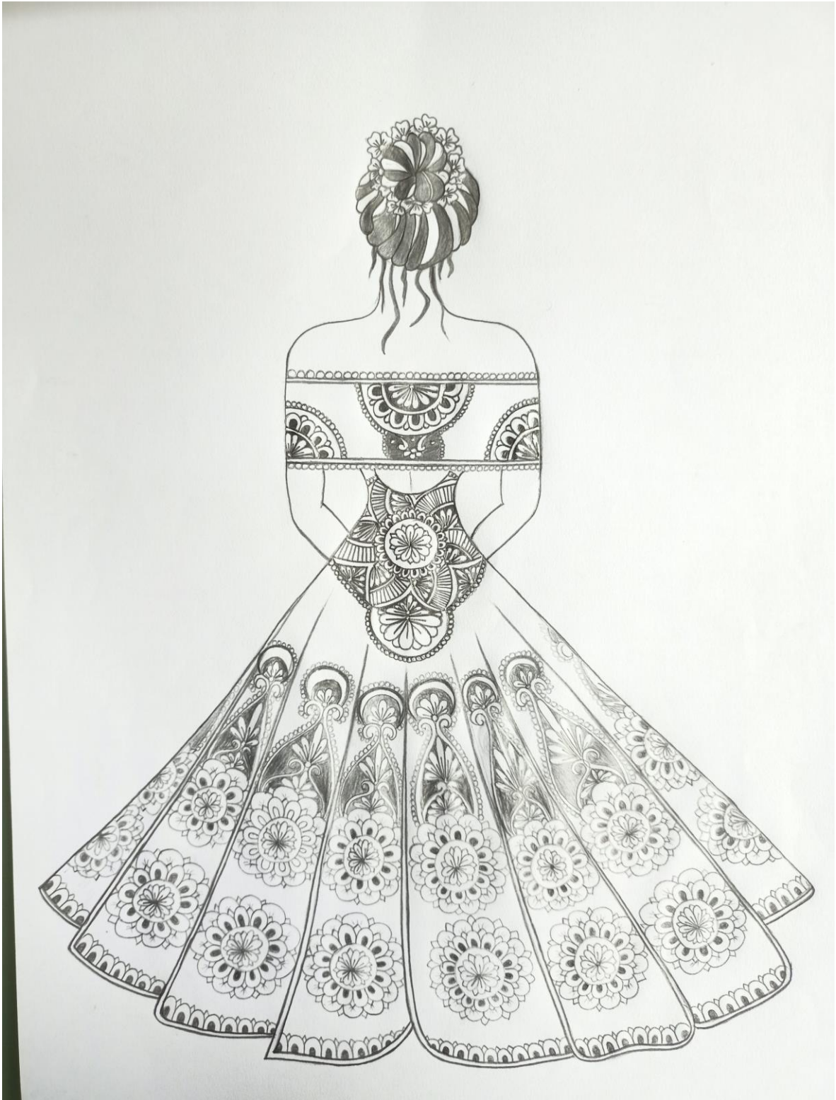
Saroja Devi E MBA-II SEM C section