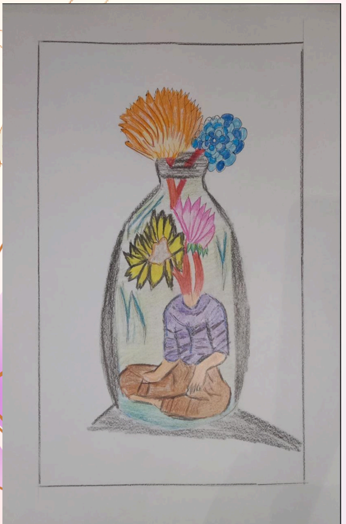
Nithya Shree.K MBA-'C'